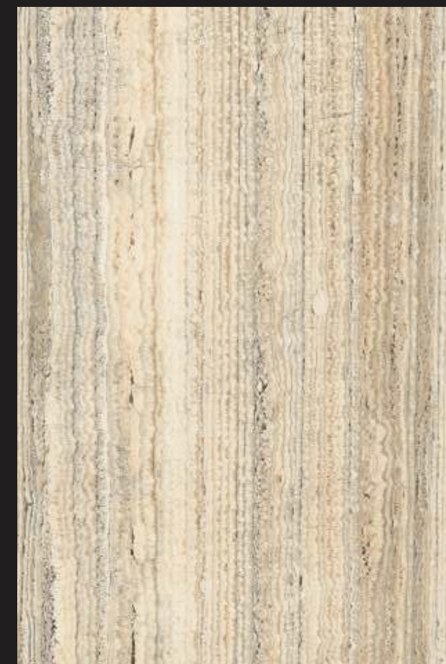
TITAN BEIGE Finish: Polished