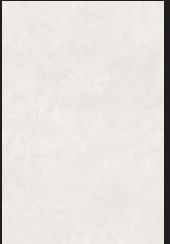
CEMENTIS BIANCO Finish: Matt