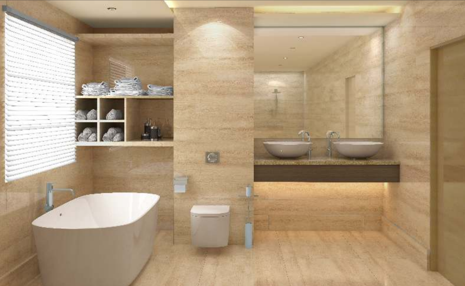
TRIVAGO Finish: Polished